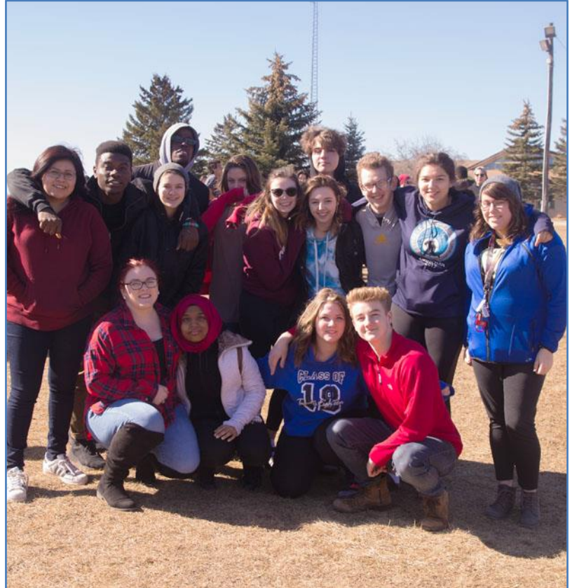
Mental Health and Wellness Theme Group 2018

The Mental Health Theme team agreed on 10 recommendations that we believe will improve young people's mental health and wellness moving forward.