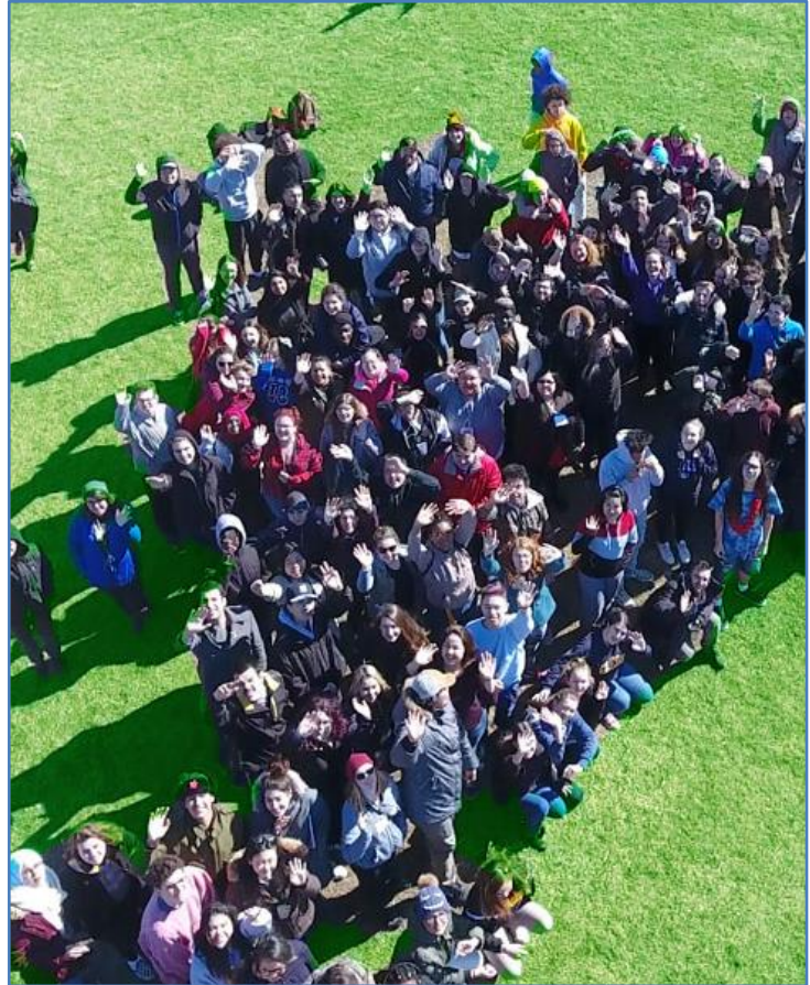
Delegates from the #CanadaWeWant Conference

This report is the culmination of these activities and reflects children and youth's perspectives on the UNCRC. It is our hope that this report will be a call to action to all adults and governments across Canada to ensure that all children and youth in Canada know their rights and can see them exercised.