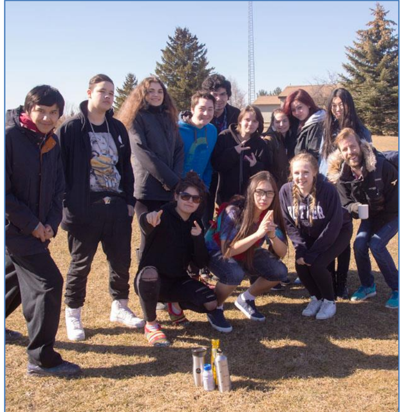
The Youth Identity Development Theme Team

This report makes three recommendations to the youth policy related to how the government can support positive youth identity development.