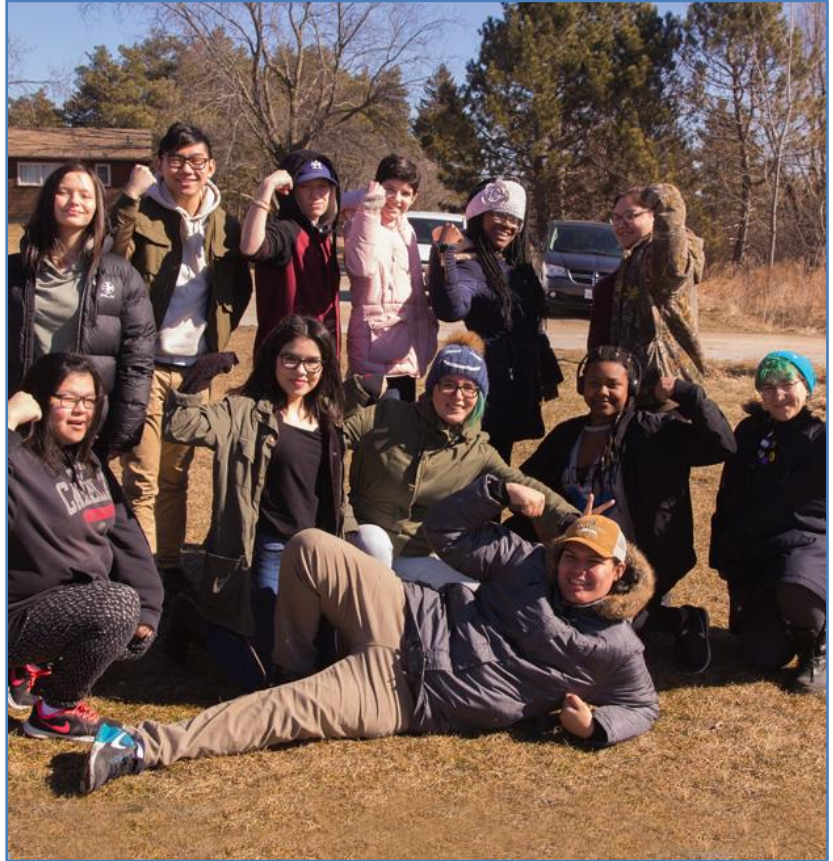
Gender-based Violence Theme Group

Gender-based violence is a reality that affects Canadians of a variety of identities, including individuals who are Indigenous, LGBTQ+, a visible minority, disabled, of a lower socioeconomic status, and many other social identities. Additionally, Canadians between the ages of 15 to 34 are most at risk (Statistics Canada, 2015). During The Canada We Want Conference, youth came from across the country to share their opinions, ideas, and personal stories related to gender-based violence in order to address this problem that takes place on both the individual and systemic level. Through building a safe space and working collaboratively, the gender-based violence theme team has designed several recommendations to address gender-based violence, as well as support survivors and empower them.