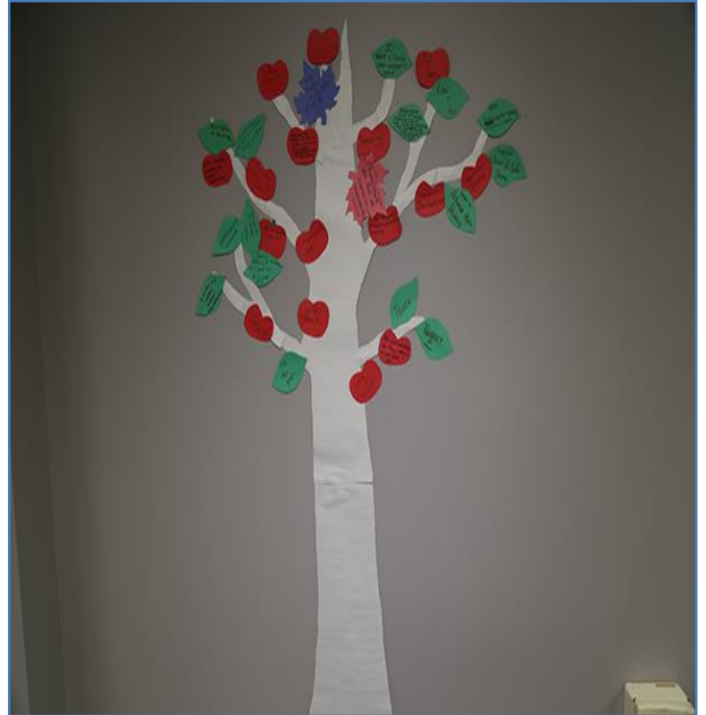
This tree has all of the dreams we have for Canada in the next 150 years. These include things like peace and a fair justice system.

The Justice System We Want theme team discussed: sentencing and responses to crime, overrepresentation of indigenous peoples and people with mental health issues in Canada's CJS, as well as restorative justice and supports for victims of crime.