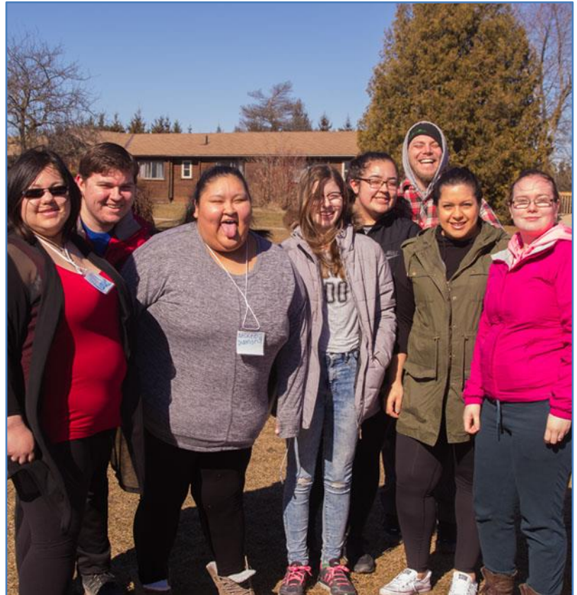
Work World We Want Theme Group

Finding solutions to issues youth face when seeking employment are complex and will require a multi-faceted problem-solving approach. We all have a responsibility to ensure that youth find ways to contribute meaningfully to their communities, and this includes a responsibility from employers of young people to recognize the privilege that is involved in employing young people. For many young people, their first job experience is critical for ensuring long-term employment success.