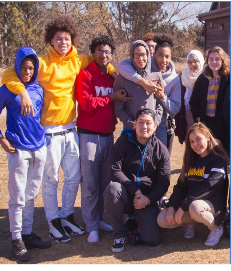
Take Charge Youth from across Canada meet to share learning