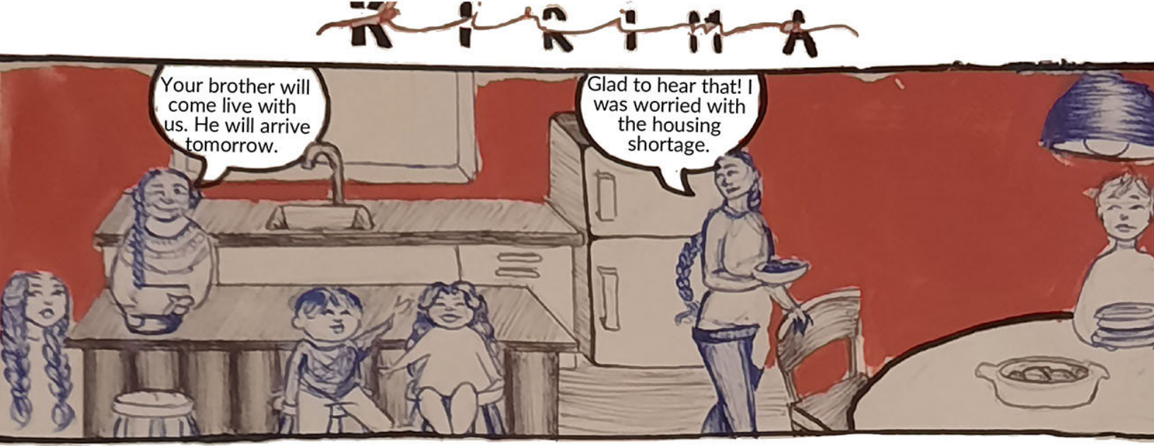
Original comic art by Oumou Khaïry Diallo