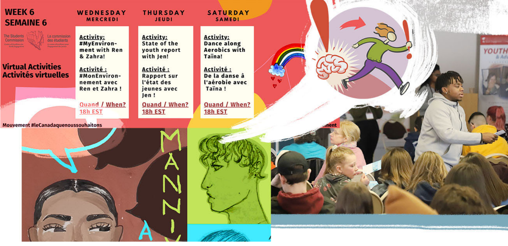
Original comic art by Oumou Khaïry Diallo and Paige Schacher